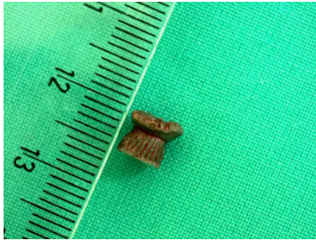
Figure 2: Postoperative removed airgun pellet.