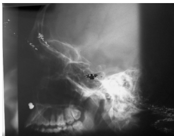
Figure 3: Lateral ski gram air gun pellet.